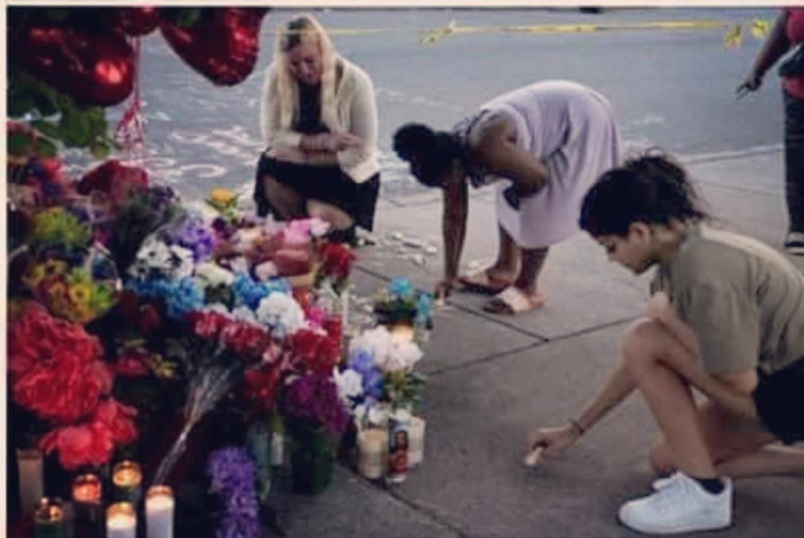
A memorial outside the Tops Market in Buffalo on Sunday.